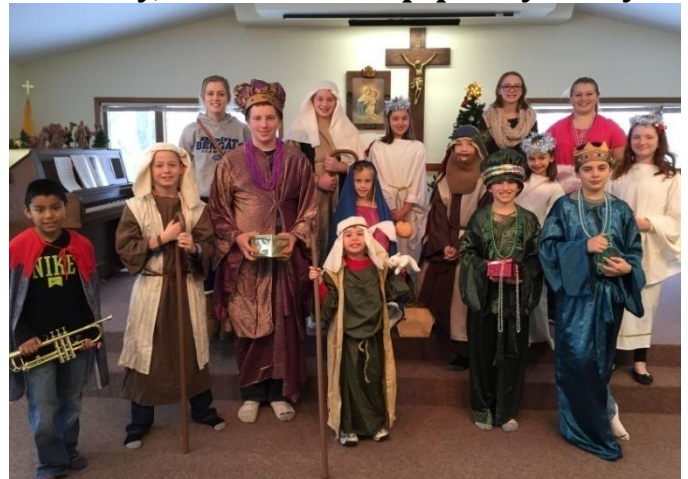
It was great to see so many young actors. The weather couldn't have been more perfect on Sunday, January 3, 2016. After a three-year drought, the Schoenstatt Family could really celebrate Baby Jesus and the great event of his Incarnation into our time and world.